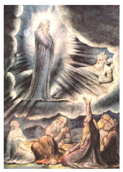
The Vision of Eliphaz by William Blake