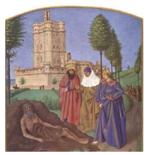
Job and his False Comforters by Chantilly Musée Conde