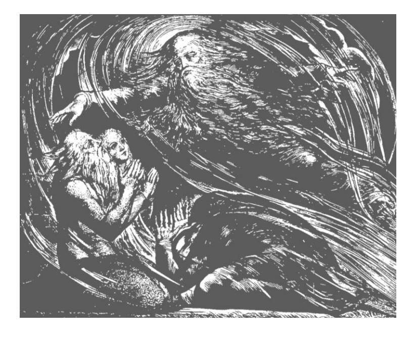
The Lord Answering Job Out of the Whirlwind by William Blake

past; the man of taste, as an incomparable specimen of poetic beauty and sublimity. It will teach invaluable lessons to each advancing generation; and to the end of time true piety and taste will find consolation and pleasure in the study of the book of Job. God grant that this effort to explain it may contribute to this result. To that God who inclined my heart to engage in the attempt to explain this ancient book, and who has given me health, and strength, and the means to prosecute the study with advantage, I now devote this exposition. I trust it may do good to others; it has been profitable and pleasant to my own soul.