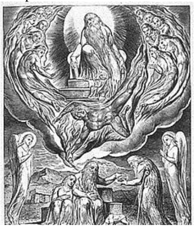
Then Went Satan from the Presence of the LORD by William Blake